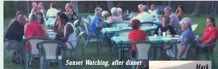
Sunset Watching, after dinner