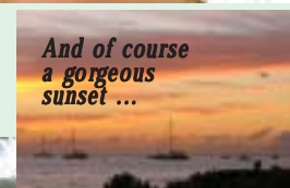
And of course a gorgeous sunset ...