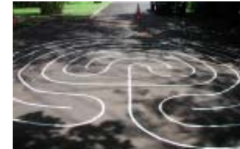
Holy I’s Labyrinth: ancient seven-circuit path is now ready for all to use.