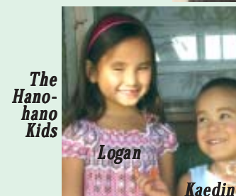
The Hano-hano Kids